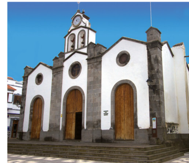
① Basilica shape with three vaulted naves

① The temple is a typical basilica shape, and is divided into three vaulted naves. Construction is simple and in an eclectic style, following designs by Laureano Arroyo de Velasco in 1887. Its frontispiece has three grey masonry doors, all topped by curved arches and crowned by three portholes, and finished in quarry stone; the frontispiece is divided into three sections, separated by stone pillars and topped by triangular points. The central section extends up to the bell tower, itself topped by a steeple in which the clock is set.